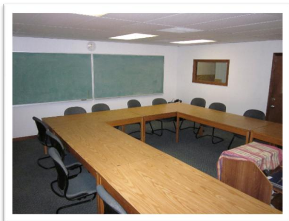
Large Conference Room (holds 25-30)

For more information or to schedule a tour please contact Judy: (413) 774-7204 x111 or judys@fccdc.org