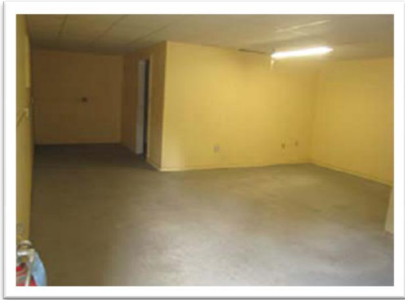
Office space (approx. 330 sq.ft.)

For small business owners seeking space in a stimulating business environment