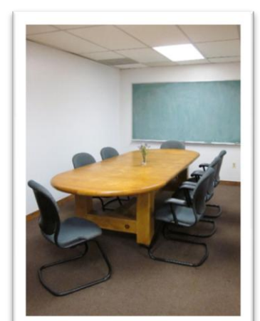
Small Conference Area

The Venture Center is a small business incubator located in a 36,000 sq. ft. industrial building. It provides space – six light industrial spaces and seven offices for start-up and growing businesses. This is an ideal way for businesses to keep their working capital costs lower during their early years of operation. Plus, you'll have lots of other like-minded businesses/entrepreneurs to help you thrive in your business!